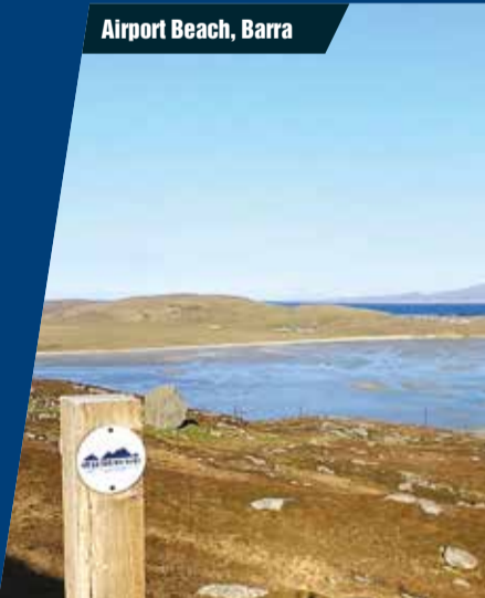
Airport Beach, Barra

Benbecula offers some fine and varied walking. Starting off along the sandy beaches of the west coast, the Hebridean Way then heads inland through fertile croft fields before climbing the small hill Ruabhal. From its summit the views to the east are astonishing – a semi-submerged landscape with more water than land. Another causeway leads north to Grimsay, a tiny island with a thriving fishing community.