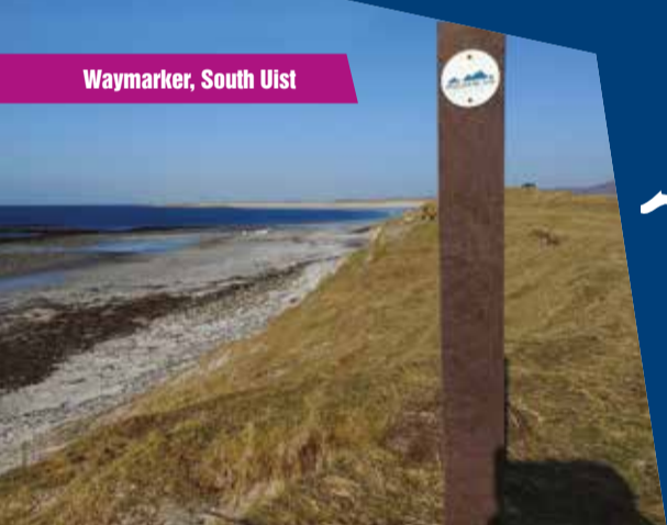
Waymarker, South Uist